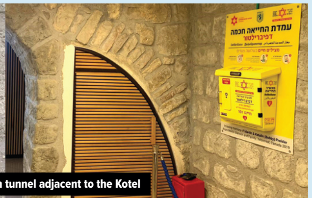
Defibrillator unit located in tunnel adjacent to the Kotel