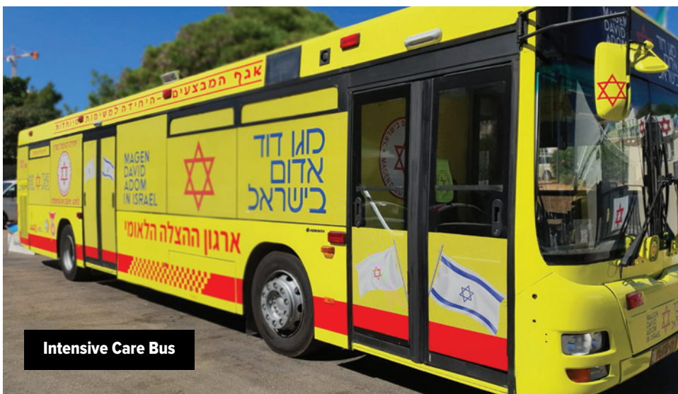
Intensive Care Bus

Magen David Adom is not a government agency and relies heavily on donations to continue saving lives. Without the medical equipment needed to fight this virus, it would be impossible to reduce the impact of the pandemic on Israelis.