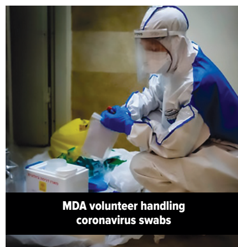
MDA volunteer handling coronavirus swabs

The coronavirus has changed Israel's medical system. MDA teams often now have to deal with situations which include critically ill patients refusing to be evacuated to hospitals.