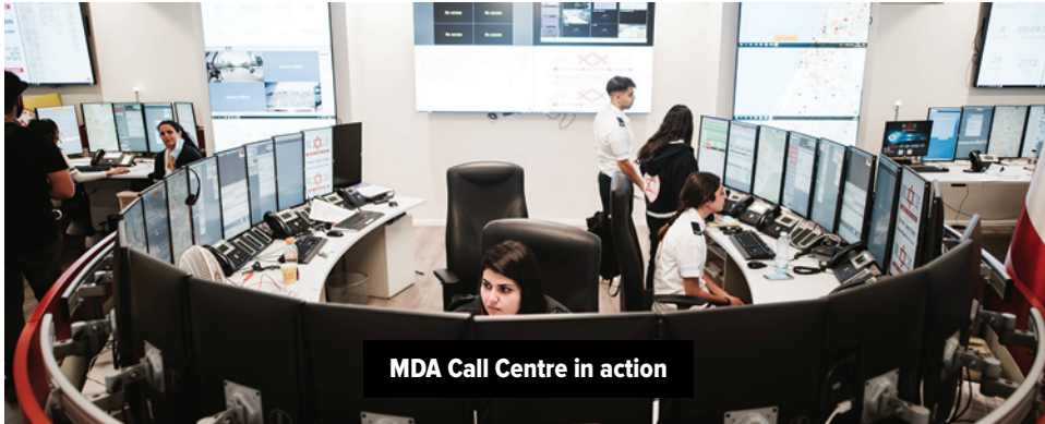
MDA Call Centre in action

test swab samples of those suspected of having the virus. MDA Blood Services continue to collect plasma from those who have recovered. "The goal is to collect enough plasma to prepare antibody concentrate with which patients will be treated. Plasma collection can only be done after 14 days have passed since full recovery," said Prof. Eilat Shinar, Director of MDA National Blood Services.