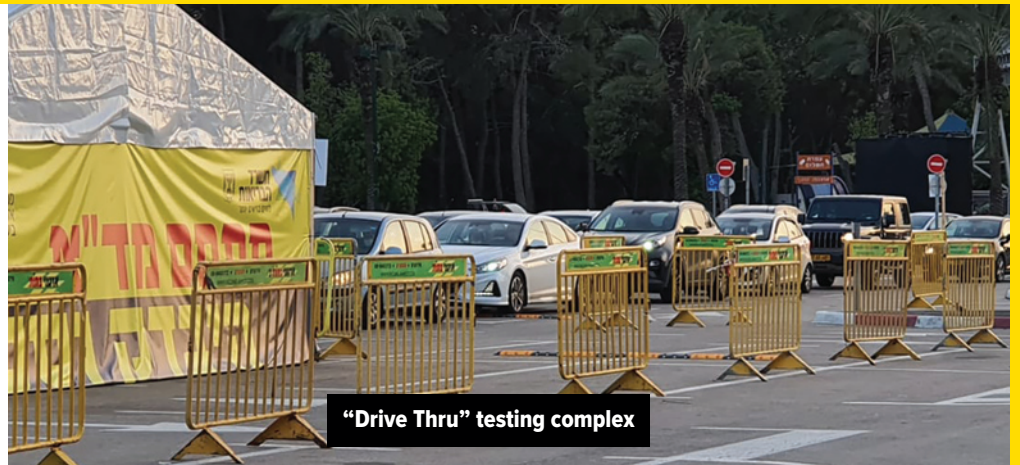
"Drive Thru" testing complex