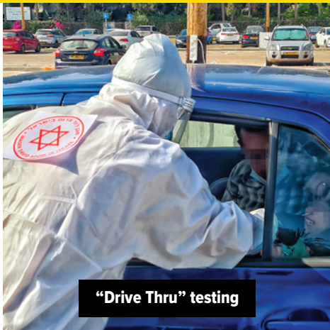
"Drive Thru" testing