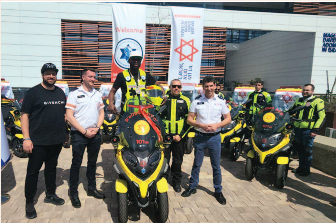
Boxing world champion Floyd Mayweather visits Magen David Adom. March 13, 2024.

During the visit, Mayweather also witnessed the devotion and professionalism of MDA's emergency dispatchers responding to emergency calls. MDA's call centres respond to emergency calls in less than three seconds, no matter where or when the call arrives. He was also shown a variety of MDA emergency vehicles used to save lives, including the ambulances, mobile intensive care units, Medi-cycles, and the Unimog, a shielded all-terrain ambulance that was used to evacuate victims from battle-zones on October 7.