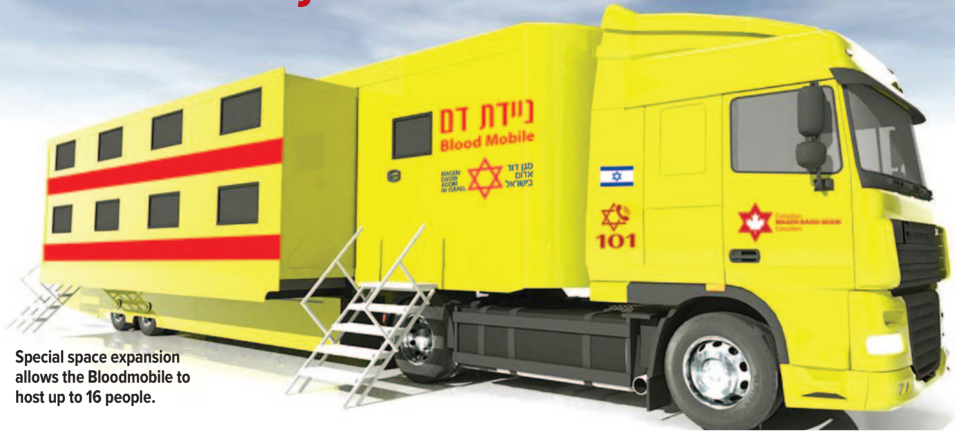
Special space expansion allows the Bloodmobile to host up to 16 people.