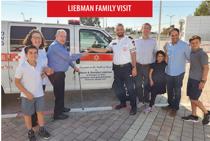
LIEBMAN FAMILY VISIT

We thank all our wonderful and generous donors who recently visited MDA facilities in Israel