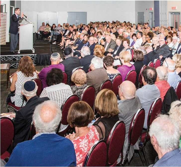
A packed house enjoys the evening's entertainment.

Executive Committee and the members has been an absolute pleasure.