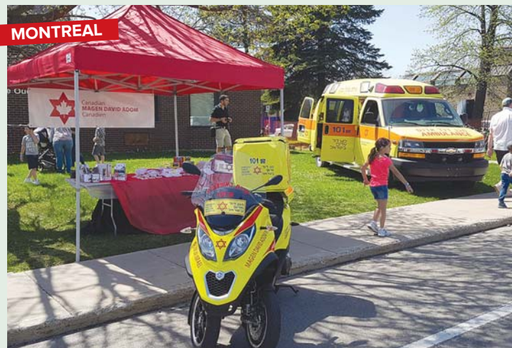
A fun time was had by all at the recent Montreal Yom Yerushalayim Celebration.

Guests had the opportunity to see first-hand a Mobile Intensive Care Unit (MICU) and an emergency medical scooter. ■