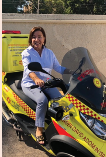
MDA's newest paramedic.