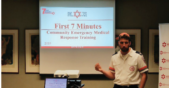
First 7-Minute seminar at Beth Tzedec Synagogue.