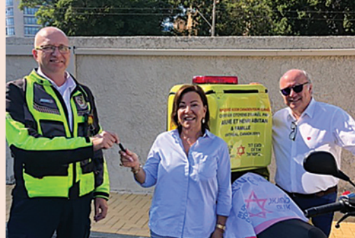
Handing over the keys.