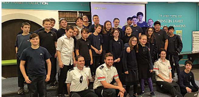
First 7-Minute seminar at Hamilton Hebrew Academy.