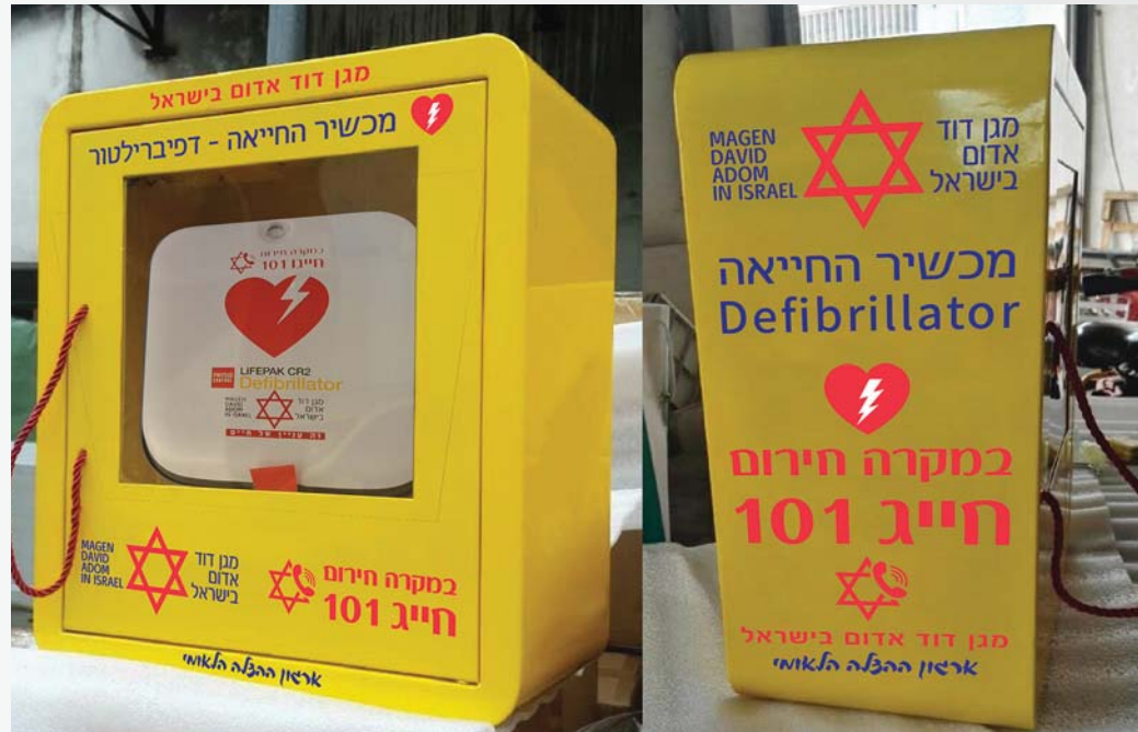
The “Lifepak CR2” Automatic External Defibrillators (AEDs) will be placed on main streets, in shopping centres and bus and train stations. Their locations will expand as the project grows.

For further information, please contact Canadian Magen David Adom – 514-731-4400 (Montreal) or 416-780-0034 (Toronto).