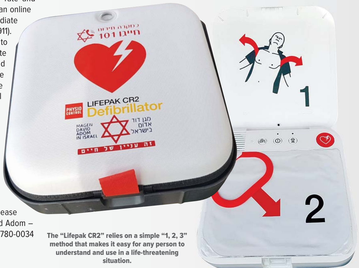
The “Lifepak CR2” relies on a simple “1, 2, 3” method that makes it easy for any person to understand and use in a life-threatening situation.