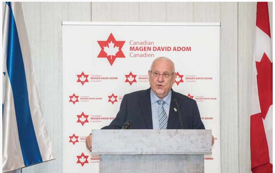
President Rivlin thanks CMDA and Magen David Adom for their life-saving work.