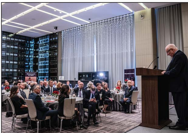
The guests enjoyed a spectacular event and learned about the vital role MDA plays in ensuring the safety of the people of Israel.