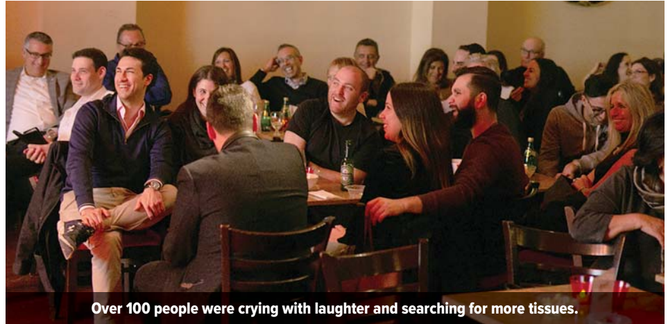
Over 100 people were crying with laughter and searching for more tissues.

Aside from the humour, what made this different than most comedy nights in Montreal was the cause. What could be more important than saving lives? CMDA's Young Leadership (YL) team worked hard for months to make its second annual LOL Comedy Soirée a big success. CMDA's YL is relatively new in the Jewish