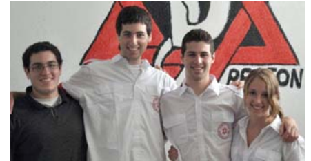
Volunteers from Canada in the Tel Aviv MDA station.