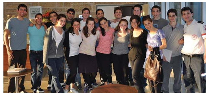
A group of Canadian volunteers during their training course in Jerusalem together with a representative of the Canadian desk.