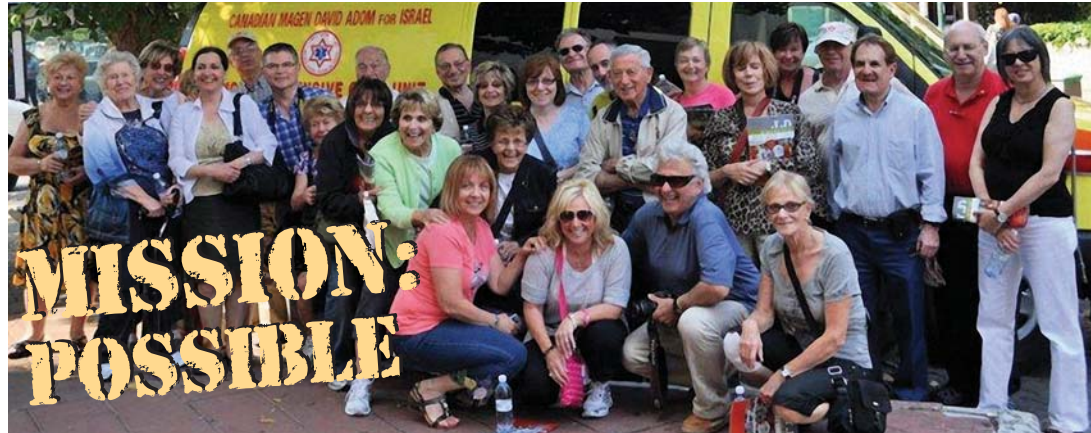
Ambassadors of Canadian Magen David Adom 2011 Mission in front of our latest 'Intensive Care Ambulance' gift to the People of Israel.

Canadian Magen David Adom has found a way to extend summer. Warm, sunny, blue skies welcomed 30 Canadian Magen David Adom 2011 Mission participants to Israel, eager and ready to embark upon an experience of a lifetime!